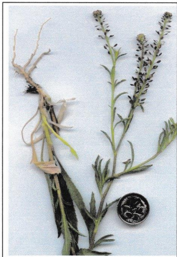
* Lepidium africanum – Pepperpress Exotic annual or perennial herb to 70cm Native of Africa

BRASSICACEAE – previously Cruciferae. The Mustard family