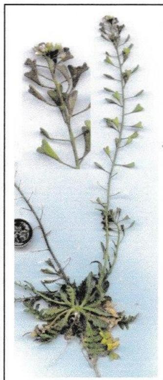
* Capsella bursa-pastoris – Shepherd's Purse Annual exotic herb to 40 cm capsa L: box or case, bursa L: purse, pastoris L: of the shepherd Native of Europe